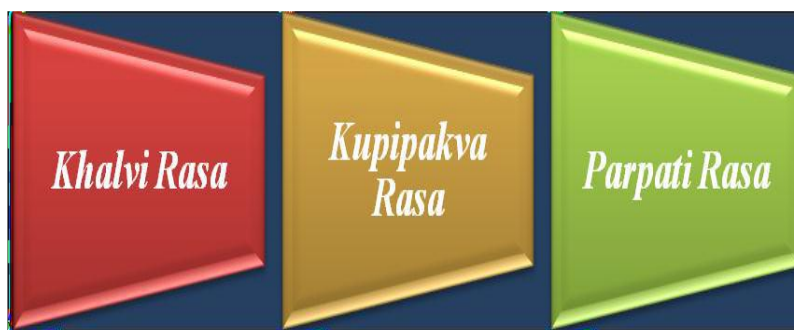
Figure 2: Formulations of Ayurveda based on principles of RasaShastra.

purification, detoxification, particle size reduction and incineration, etc. not only convert incompatible elements into compatible elements but also enhances therapeutic properties, improves absorption and imparts palatability. Some unique formulations of ayurveda based on principles of Rasa Shastra depicted in Figure 2 .