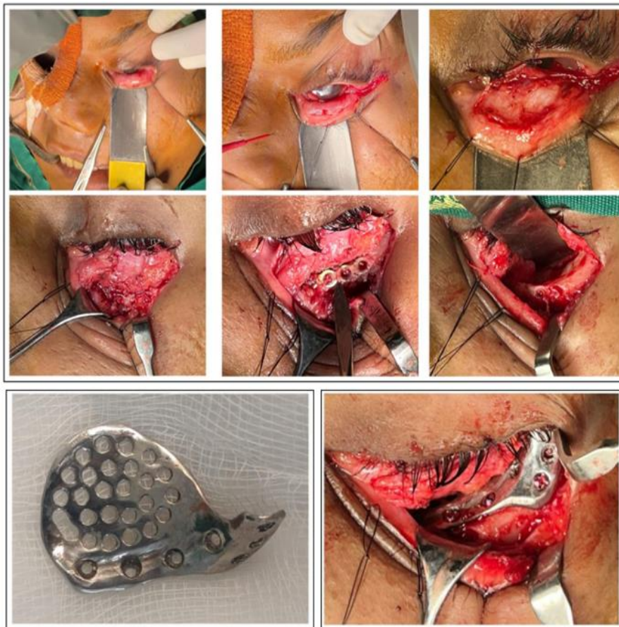
Fig 2 - Intraoperative photographs